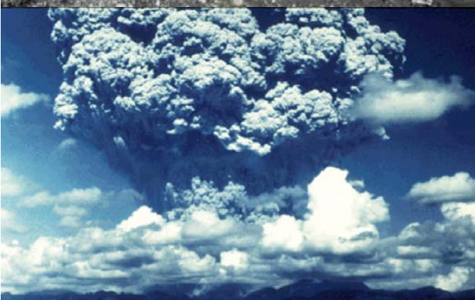
MT PINATUBO ERUPTION—1990