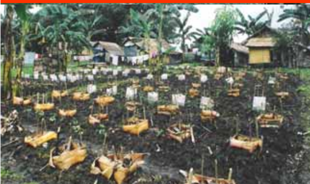
SEEDBANKS AND NURSERY