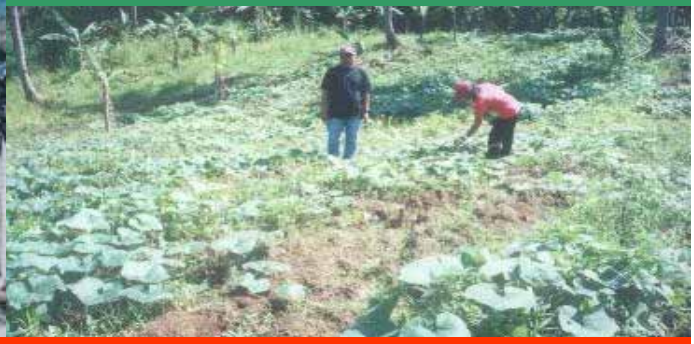
DIVERSIFICATION OF CROPS