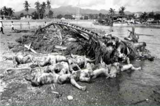
FLASHFLOODS—Ormoc City, 1991