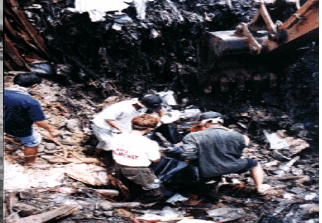
TRASHSLIDE— Payatas, 2000