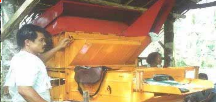
PROVISION OF POST-HARVEST FACILITIES