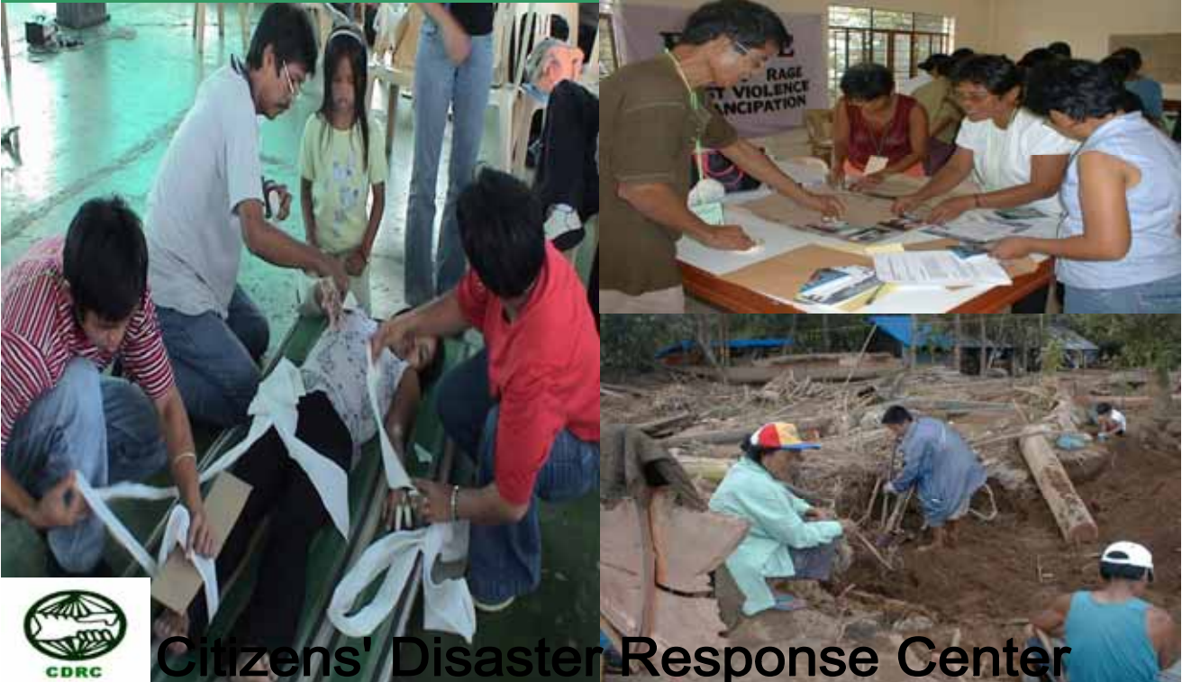
Citizens' Disaster Response Center

Building the organizational capacity of the vulnerable sectors is done through: