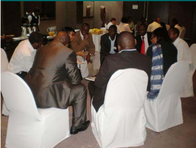
Multi-stakeholder group discussing issues around health insurance in Zambia at the Health Insurance workshop in Lusaka Zambia, May 5, 2010