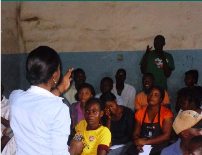
Madison Life conducting a market research and sales presentation for funeral insurance with micro and small entrepreneurs in Lusaka, as part of the microinsurance pilot, November 2010