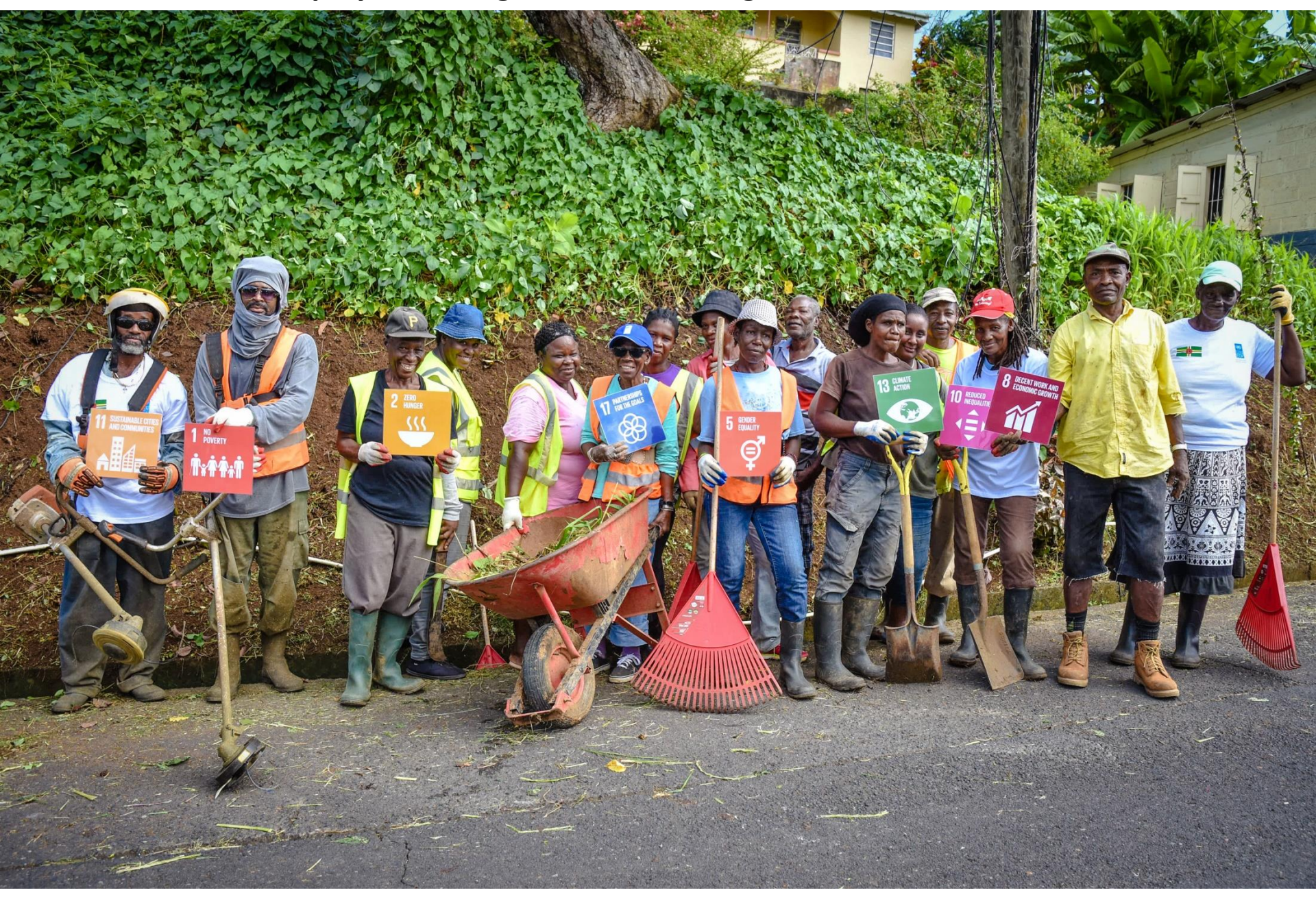
National Employment Programme – Cleaning & Beautification