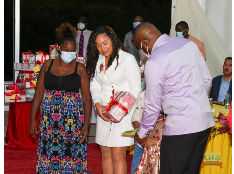
PM & Family brings comfort to the less fortunate