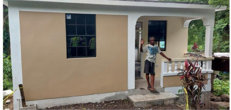
Resilient, modern housing for victims of 'Maria'