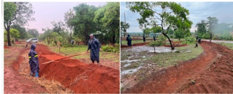
Filling beds with "Spongy" material to retain water and fertility