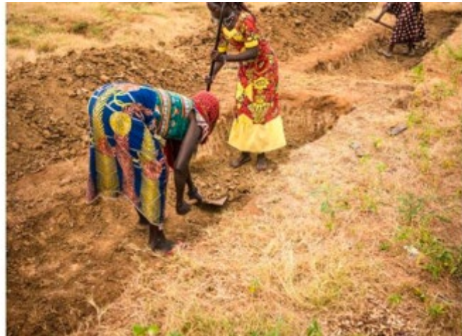
Food Forest Establishment after the Training + Community Scaling up Land Design